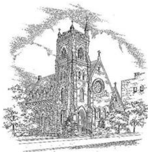
-Drawing of St. Paul's Church by Dan Lyon