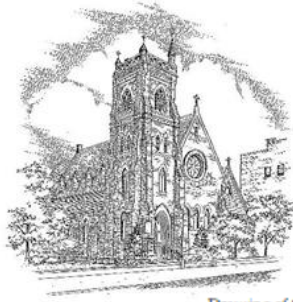
-Drawing of St. Paul's Church by Dan Lyon

CHURCH & PARISH OFFICE @ St. Paul's Episcopal Church 65 North Main Street, Wallingford, CT